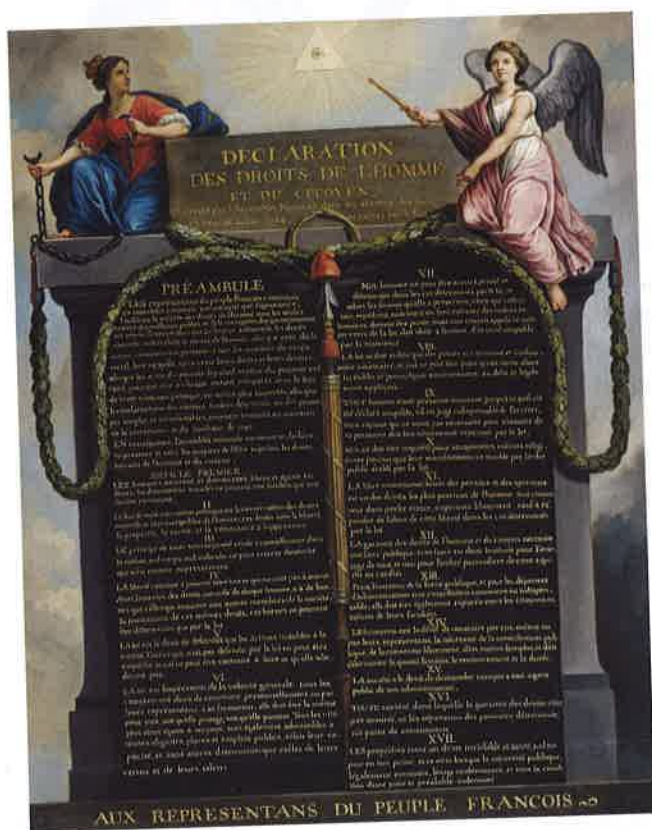
Painting of the declaration

The National Assembly issued this document in 1789 after having overthrown the established government in the early stages of the French Revolution. The document was modeled in part on the English Bill of Rights and on the American Declaration of Independence. The basic principles of the French declaration were those that inspired the revolution, such as the freedom and equality of all male citizens before the law. The Articles below identify additional principles.